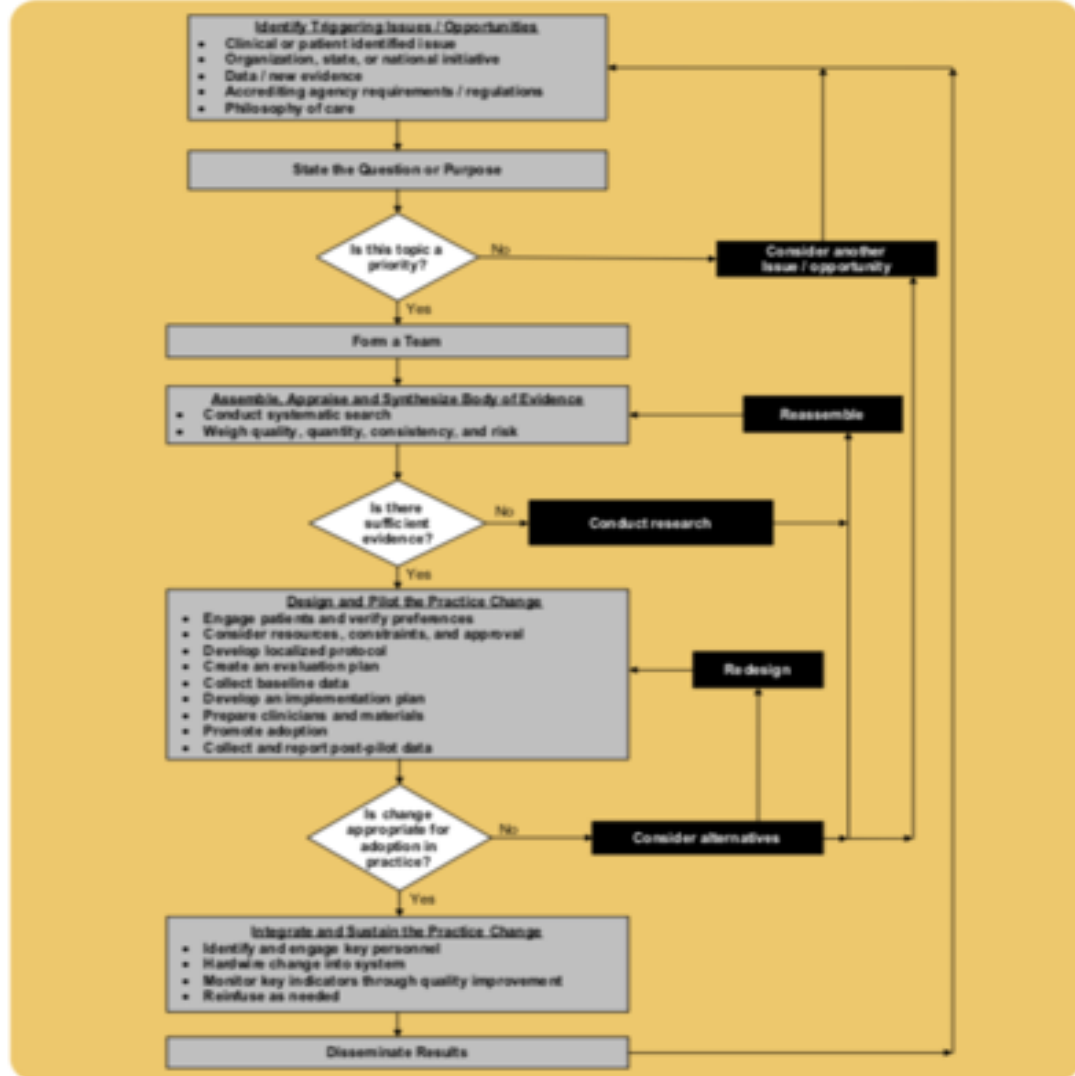
Figure 1. The Iowa Model flow chart. This figure illustrates the 4 phases to use evidence-based practice to promote health care.

Next, the methods to be used in this integrative review will be presented.